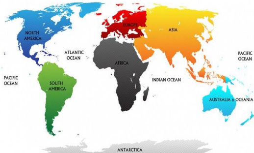
Continents & Oceans